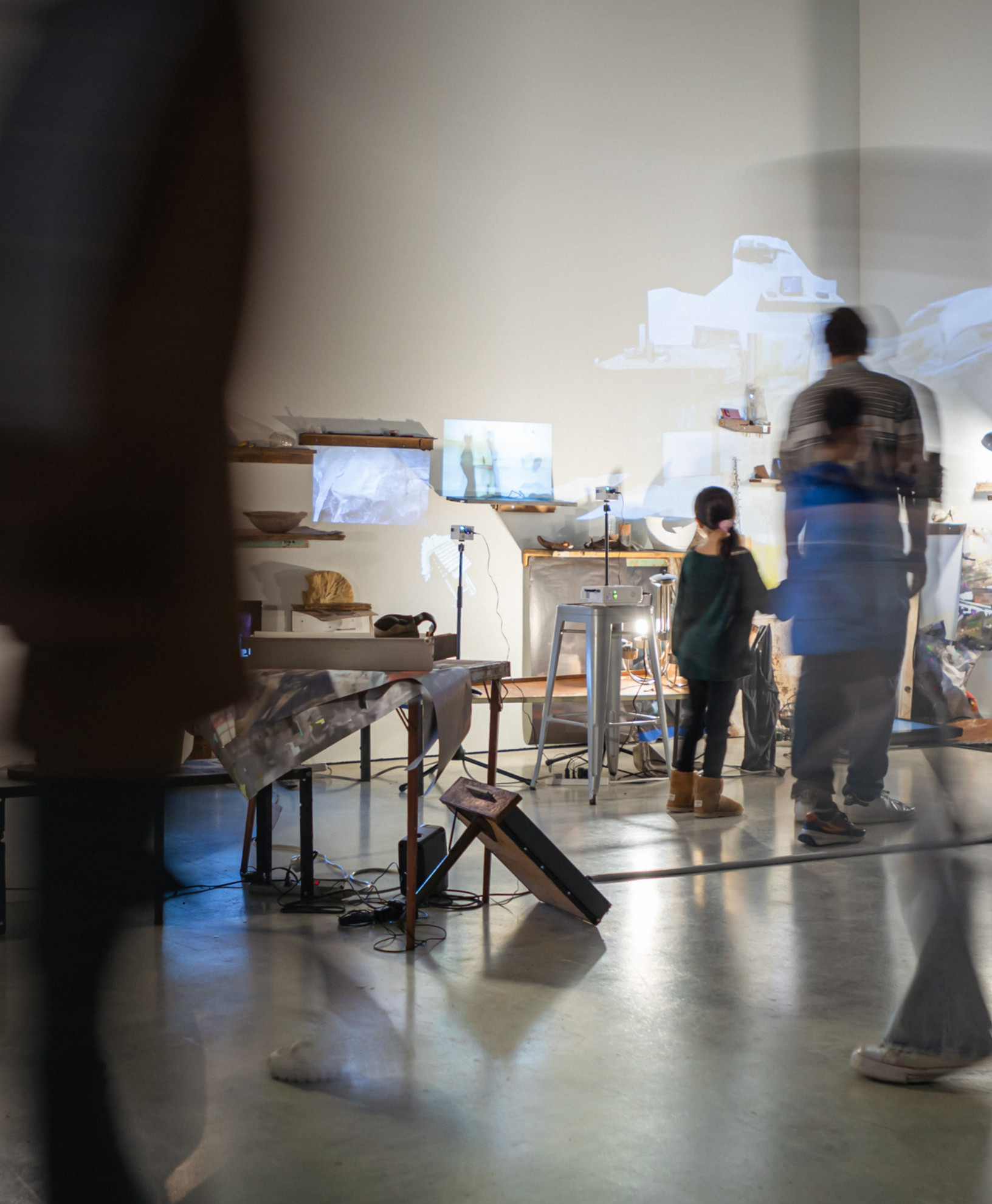
Visitors interacting with "pixel / dust" by Sasha Opeiko