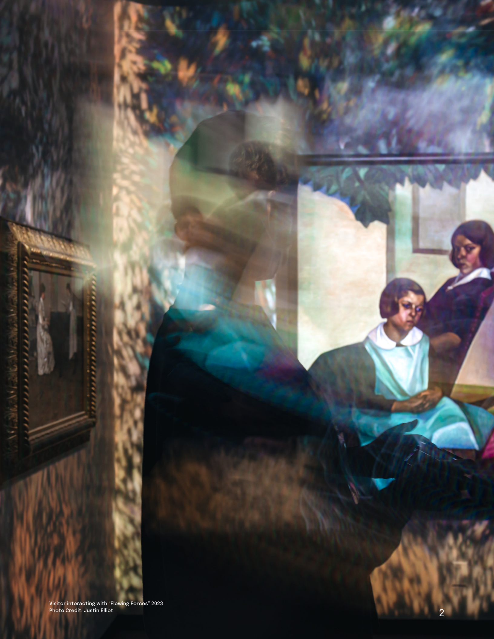
Visitor interacting with "Flowing Forces" 2023